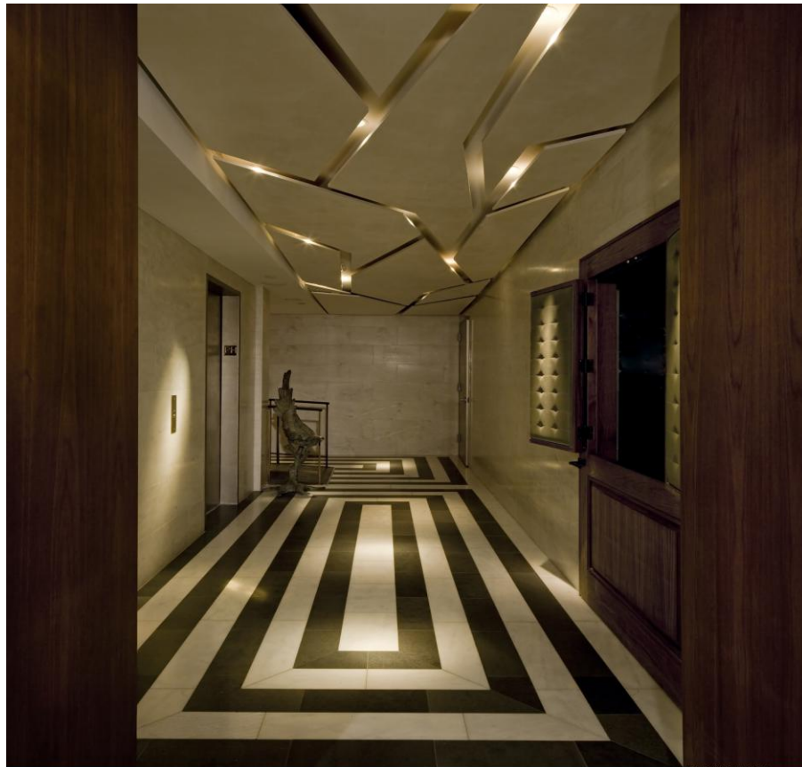
The Kimberly Hotel 212 702 1600 145 East 50th Street New York New York 10022