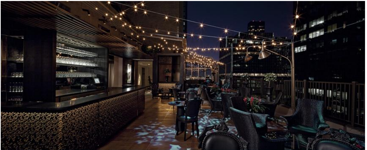
Main Roof-Deck Views

The Kimberly Hotel 212 702 1600 145 East 50th Street New York New York 10022